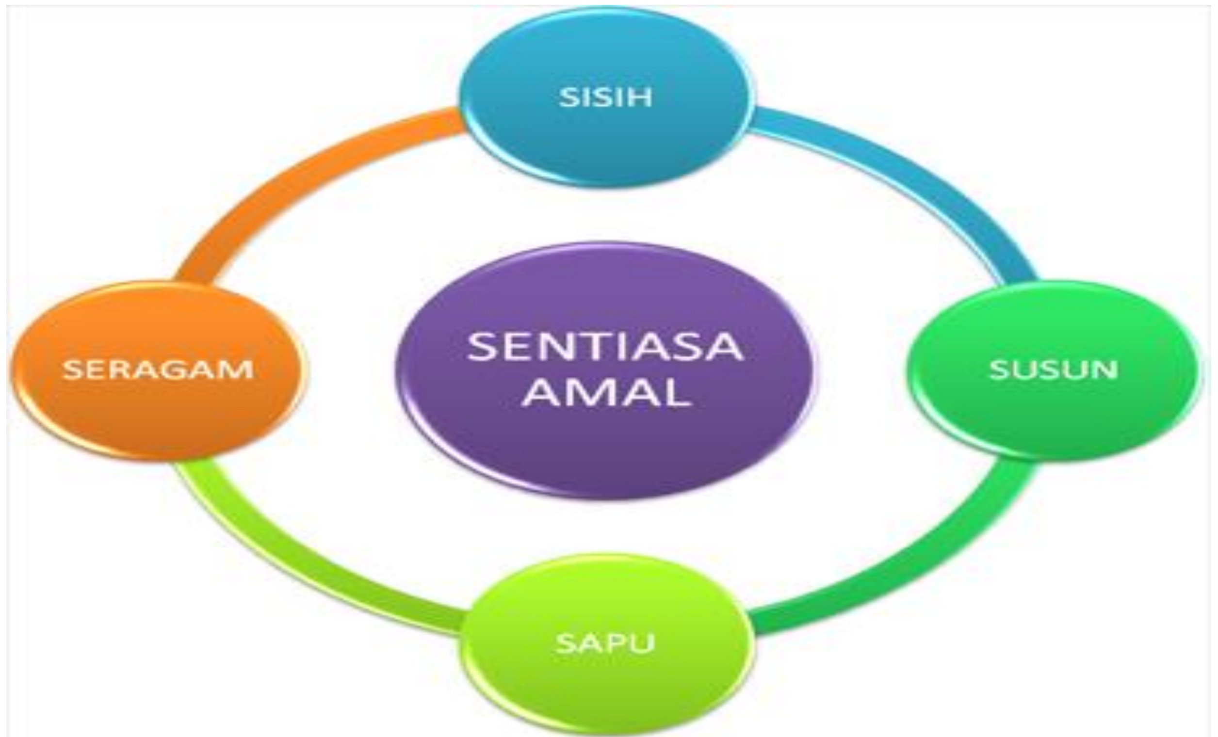
Kitaran Amalan 5S